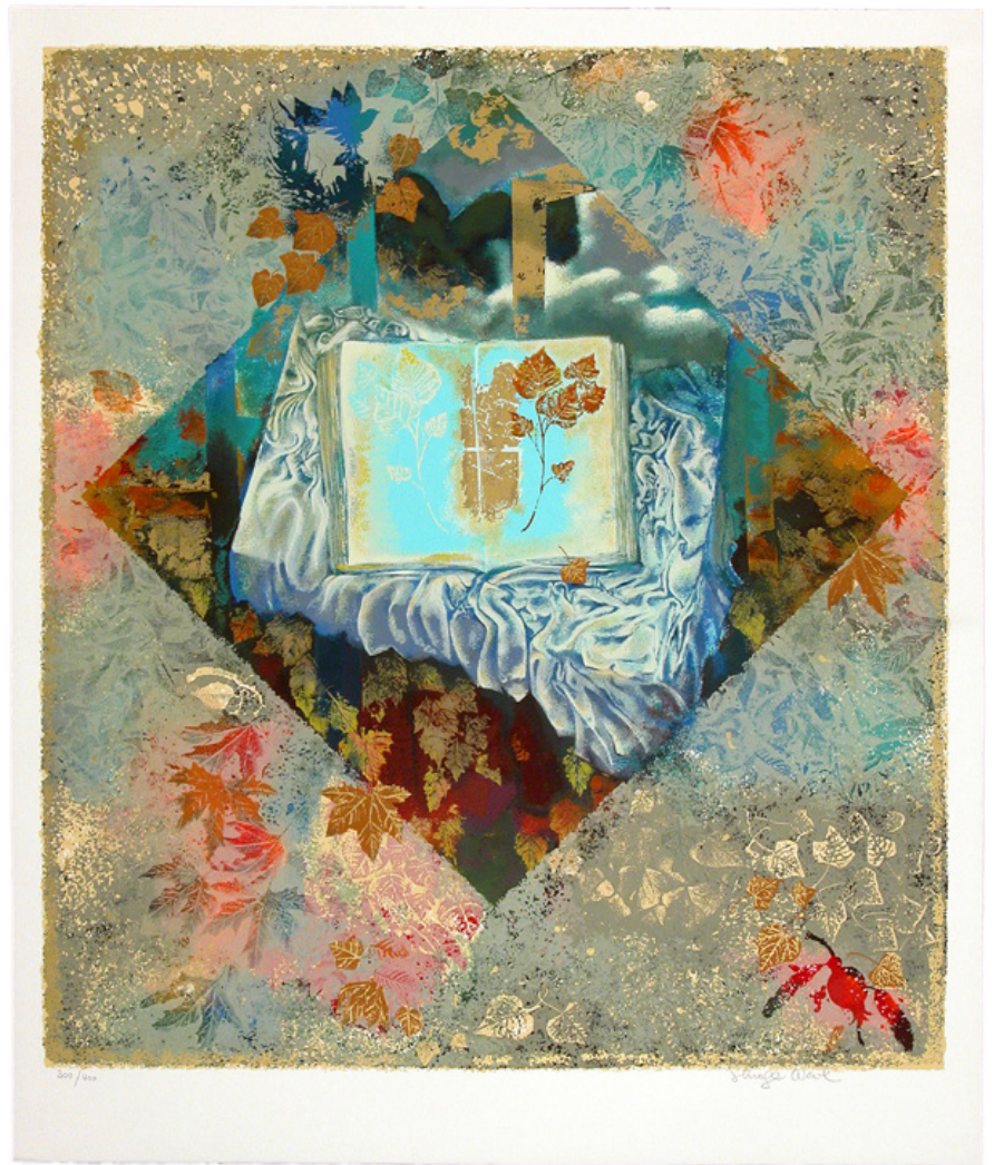
This painting is called Book of Life by Shraga Weil