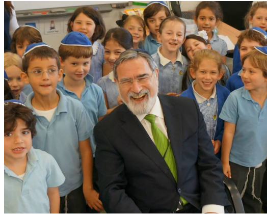
Credo, The Times (8 December 2012)

Whenever I visit a Jewish school today, I see on the smiling faces of the children the ever-renewed power of that faith whose symbol is Chanukah and its light of inextinguishable hope.